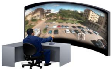
Immersive Monitoring, Continuous Activity Tracking, Event Recognition, and Alert Signaling

Challenges: Develop and install a high-visibility demonstration system that can visually monitor individuals and their activities for extended periods of time by recognizing and "handing off" tracked objects from one sensor node to another and recognizing key events, such as an individual entering a restricted area.