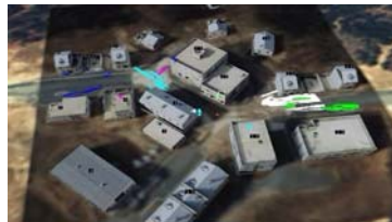
Real-time Video Overlay on 3D Model